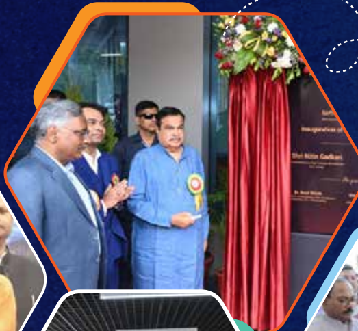
LAUNCH OF INCUBATION FACILITY AT NAGPUR