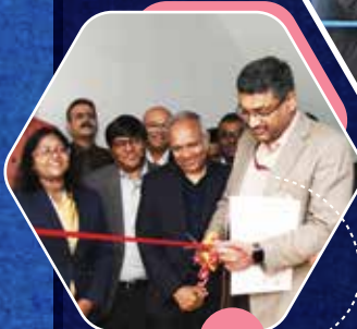
INAUGURATION OF INCUBATION AND LAB FACILITY AT GUWAHATI