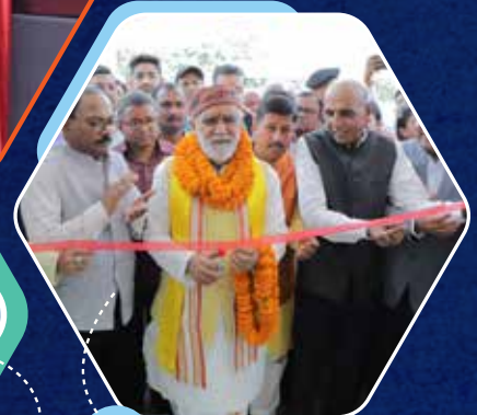
INAUGURATION OF STPI CENTRE AT BHAGALPUR