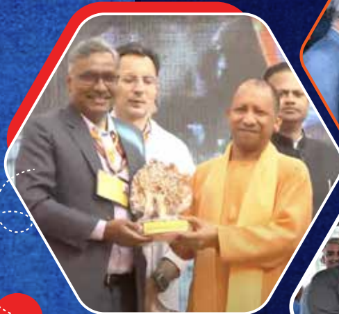
FOUNDATION STONE LAID FOR STPI CENTRE AT BAREILLY