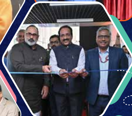
LAUNCH OF STPI CENTRES AT THIRUVANANTHAPURAM AND KOCHI