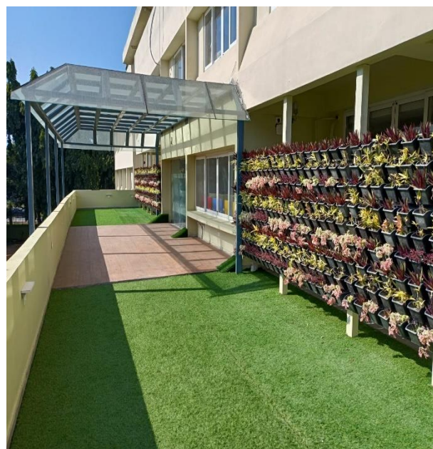
Figure: Actual photographs of the SIZ area in STPI-Guwahati CoE (IoT in Agriculture)

The total SIZ area (built-up carpet) at STPI-Guwahati CoE approximately is 1592.49 Sq. ft. (1286.99 Sq.ft as outside terrace space and 305.50 sq.ft. as SIZ display area) available on 1 st floor of STPI-Guwahati office building. In addition to this, STPI-Guwahati also has open space at back yard of the office building which may also be used for establishment of the SIZ.