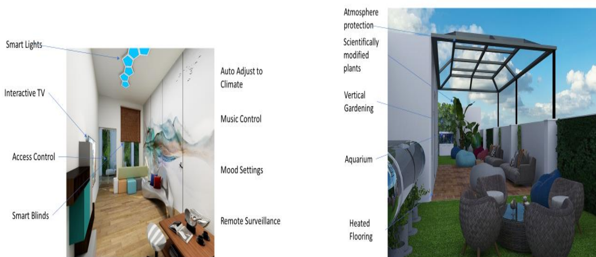
Figure: A basic concept of IoT SIZ(just for reference).

A layout diagram of the SIZ area at STPI-Guwahati CoE along with some indicative basic concept are given below for reference of prospective agencies. It may be noted that the physical area as shown in below SIZ area is ready, however the equipment shown are not present and just part of a concept only.